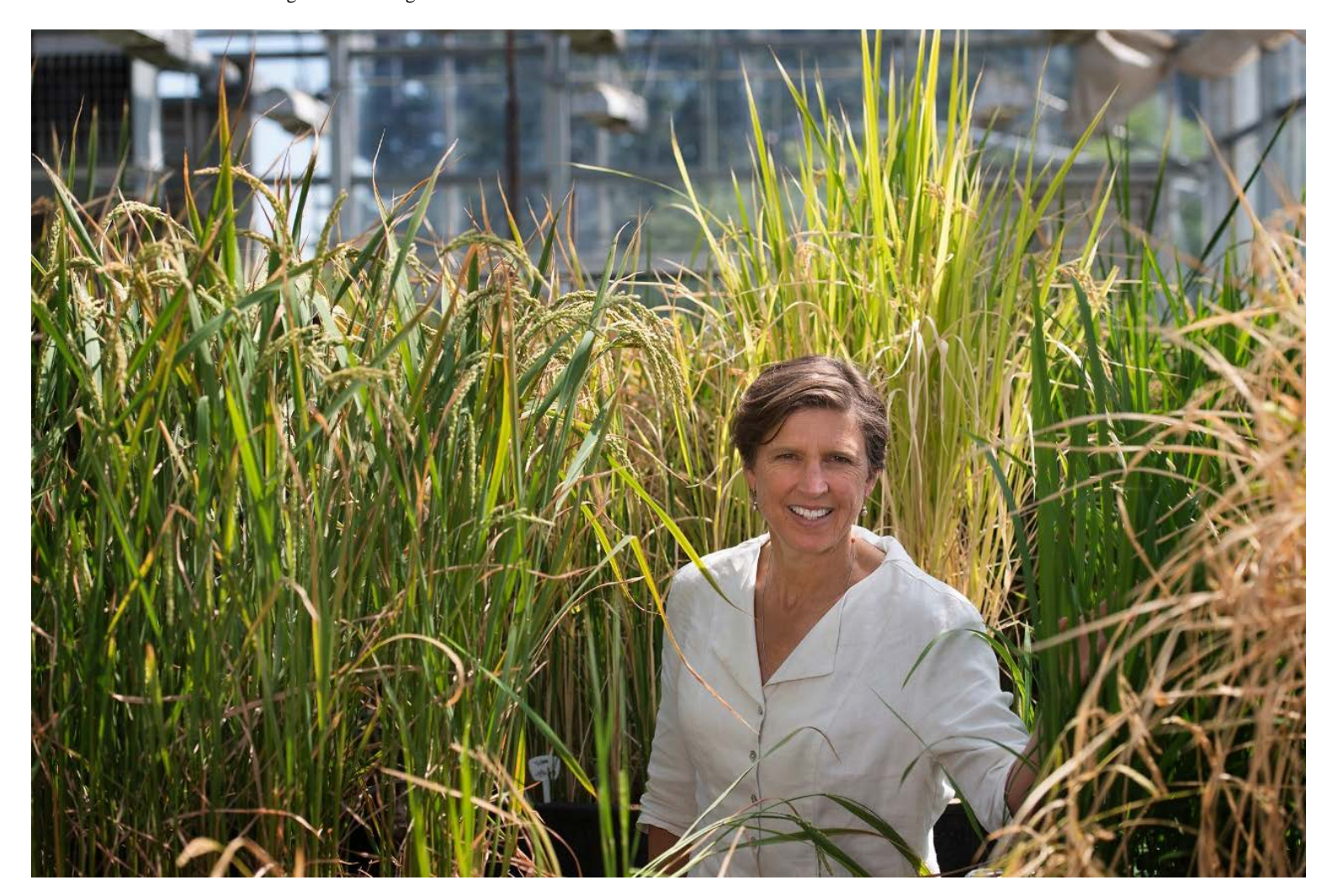
Pamela Ronald's UC Davis lab has isolated disease- and flood-resistant genes in rice. Now millions of subsistence farmers can grow high-yield harvests in blight- and flood-prone places.