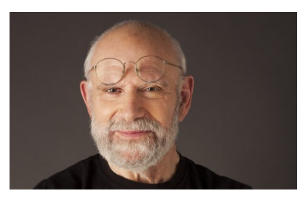
Awakening the Mind: A Celebration of the Life and Work of Oliver Sacks